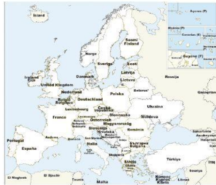
The eProcurement Map

A map of activities having an impact on the development of European interoperable eProcurement solutions