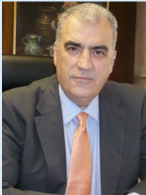
Dimitris Reppas Minister of Administrative Reform and eGovernment