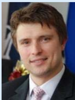
Ivo Ivanovski Minister of Information Society and Administration